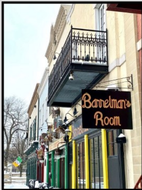
Exterior Private Balcony