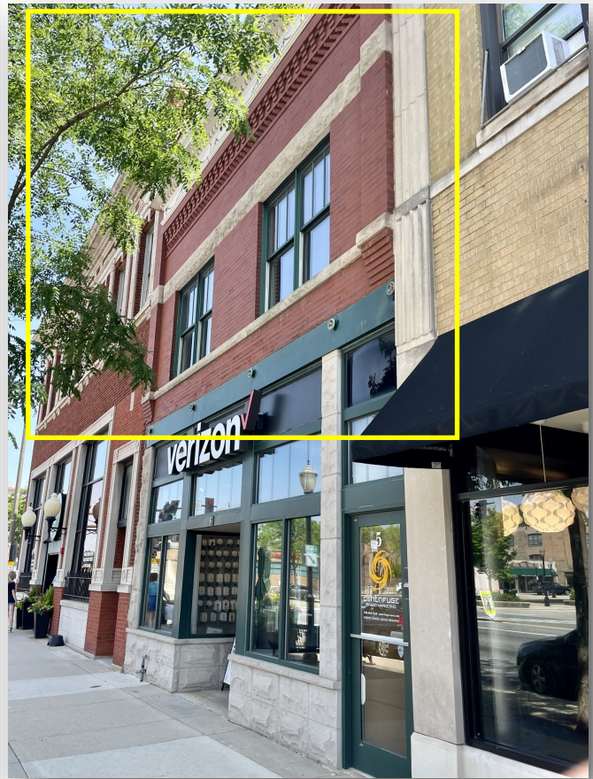
5 S. LaGrange Road, La Grange 2nd Floor Loft Office