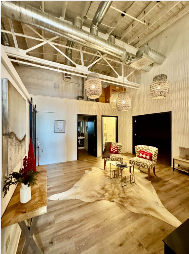
311 W. Hillgrove Ave, La Grange Prime 1st Floor Office or Retail