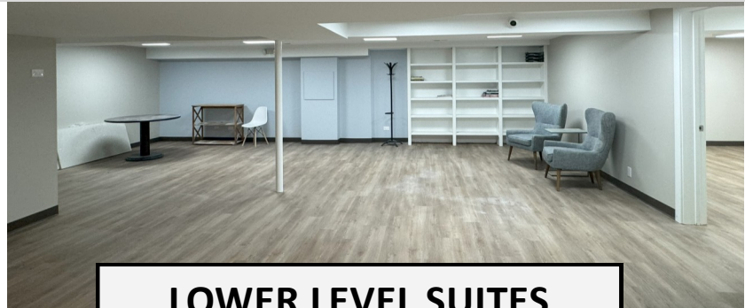
LOWER LEVEL SUITES